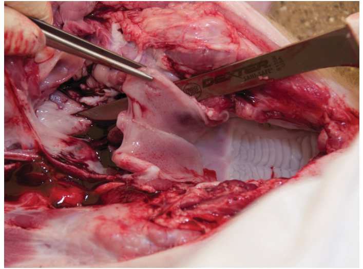
Tonsils are another tissue that can be tested for ASF. Spleen is the preferred specimen when possible.